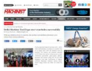
The Machinist, August 18, 2017