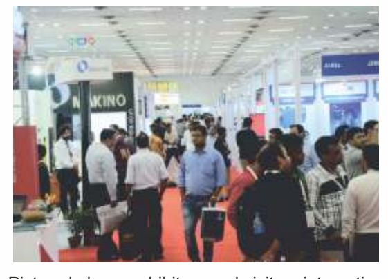
Pictured above exhibitors and visitors interacting during the expo in Pragati Maidan