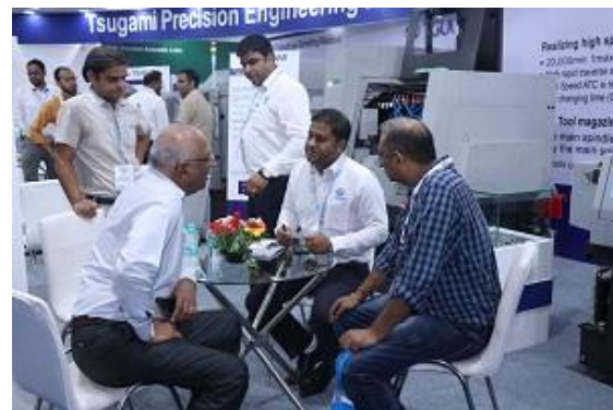
Pictured above: Visitors engaged in discussions with exhibitors