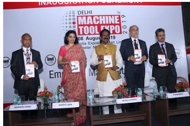
Release of publications at the inaugural ceremony

Spread across two halls (Hall 14 and 15) the expo showcased state-of-the-art technologies focusing on manufacturing solutions for metal working industries based in and around Delhi and NCR. The expo had a significant presence of 122 exhibitors from 6 countries: China, Germany, India, Japan, Taiwan and USA.