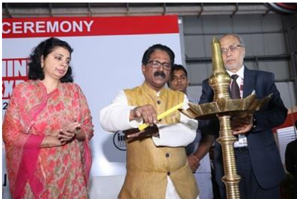
Shri Arvind Ganpat Sawant lighting the lamp at inauguration ceremony