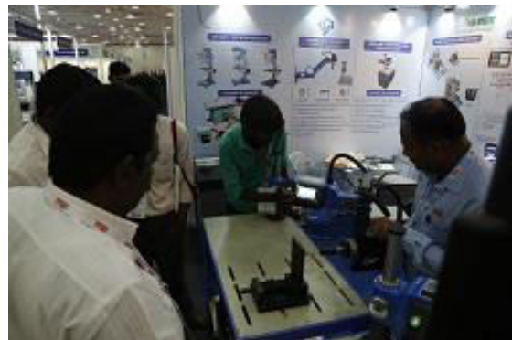
Pictured above: Visitors engaged in discussions with exhibitors