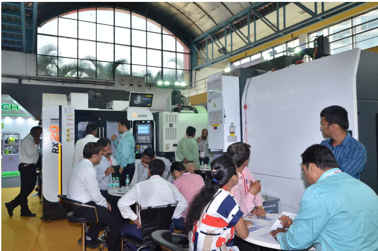
Business transactions in progress at Pune Machine Tool Expo 2018