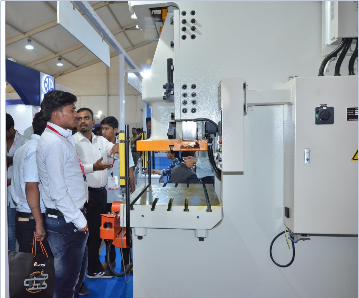
Visitor examining a machine at the Expo