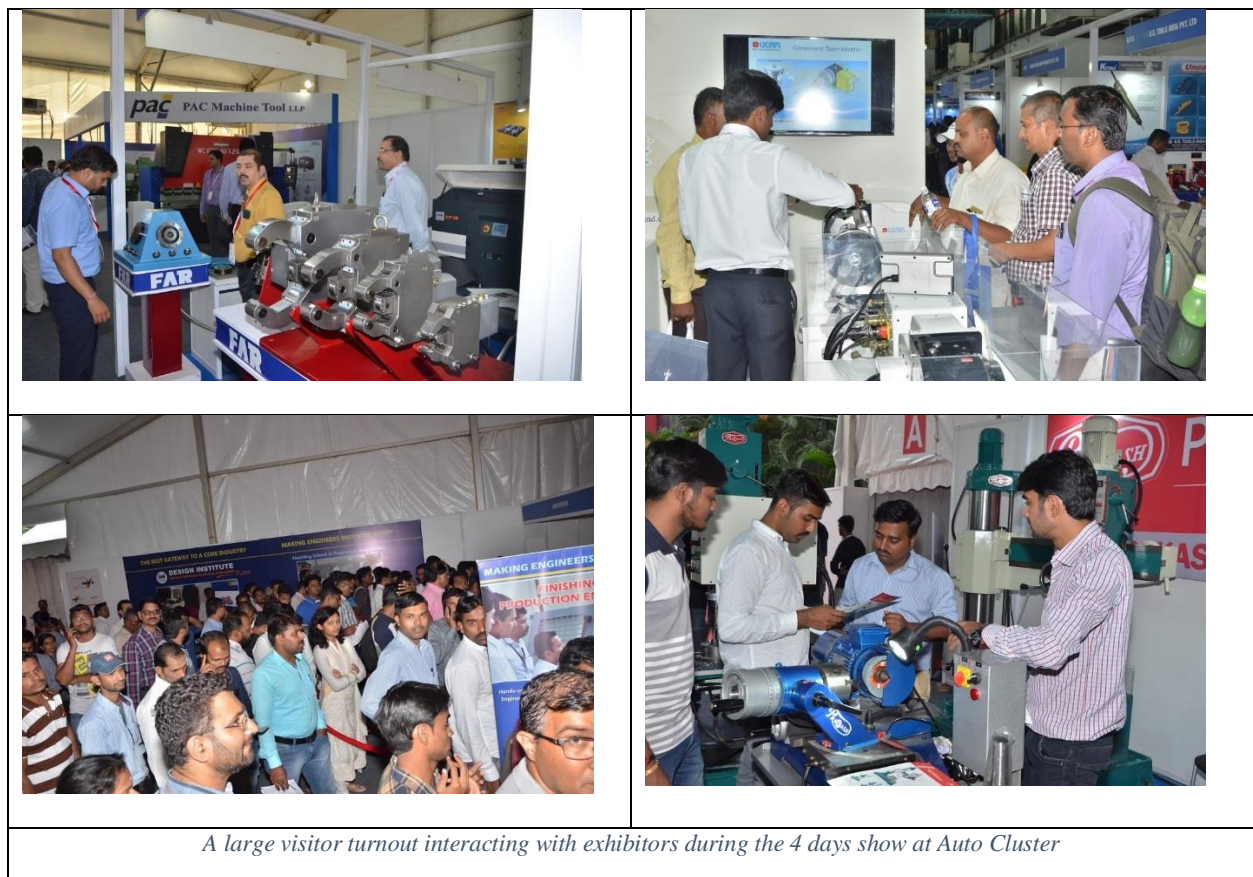
A large visitor turnout interacting with exhibitors during the 4 days show at Auto Cluster