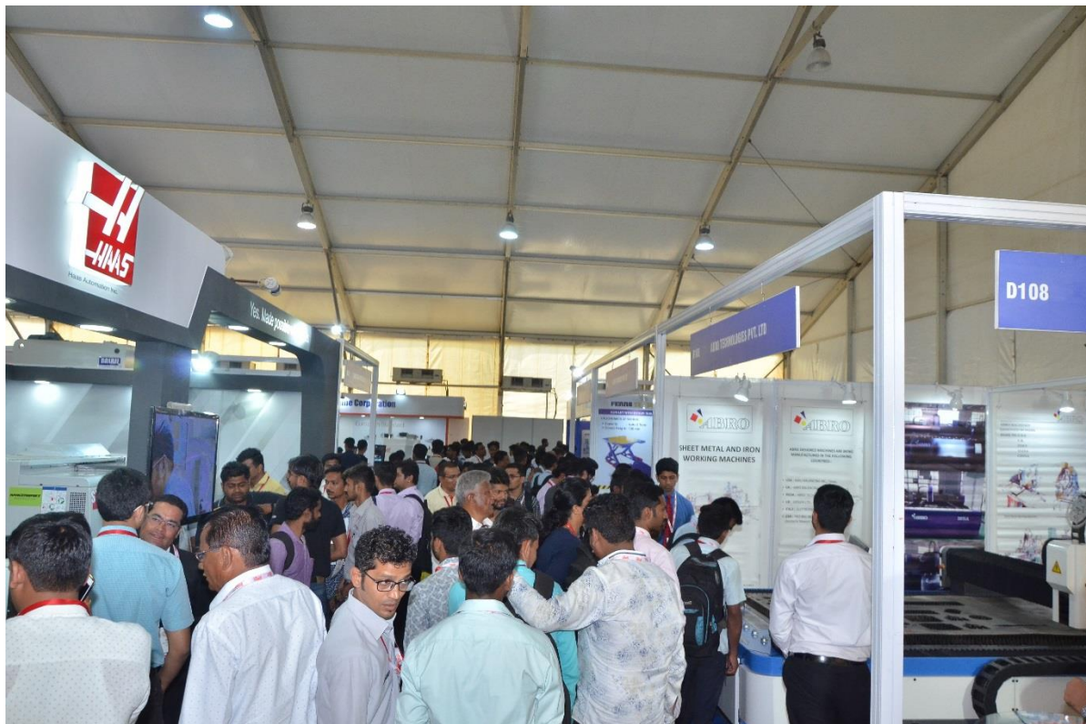
Inside view of the halls during the Expo